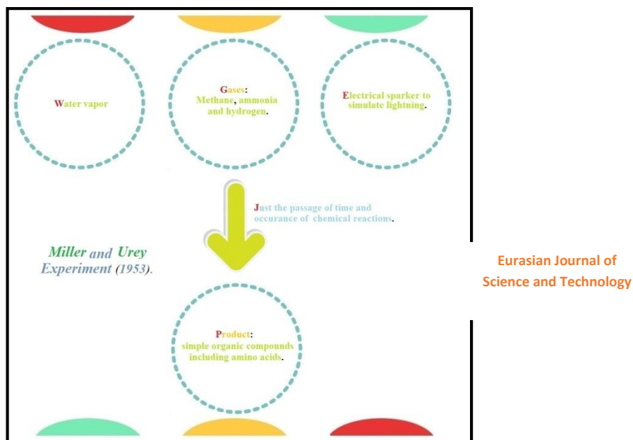
Scheme 2 Stanley miller and Harold Urey experiment (1953) [33, 46]

Lipids (which provide the foundation for the structure and function of living cells), nucleic acids, and proteins are the three essential components of all living things, and understanding them is very important to understanding abiogenesis. These components had to be present in the primordial soup from which life originated. Lipids, which form the cell membranes, play a significant role in abiogenesis. Their unique structure enables them to assemble into spherical structures when immersed in water. These structures