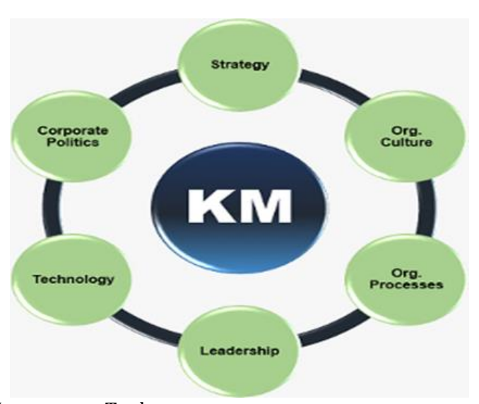
Figure 1 Knowledge Management Tools

Other studies have looked at each of the factors influencing organizational knowledge transfer, not discretely, but integrally, including the research by McEville and colleagues (2002), reporting that competency-based trust has a greater impact on individual knowledge transfer. Hans (1999) approached the transfer of individual knowledge and knowledge transfer (Figure 1). The results of this study showed that the transfer of individual knowledge in the process of knowledge transfer is more important than the development of knowledge transfer [6].